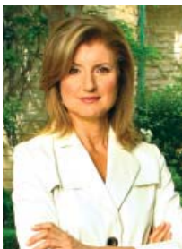
ARIANNA HUFFINGTON Opening Plenary Aug. 14

Mr. Johnston has served on many provincial and federal task forces and committees. He has also served on the boards of a number of companies. He was the founding chair of the National Round Table on the Environment and the Economy, chaired the federal government's Information Highway Advisory Council, and served as the first non-American chair of the Board of Overseers at Harvard University. He is the author or co-author of two dozen books, holds honorary doctorates from over a dozen universities, and is Companion of the Order of Canada since 1997. Mr. Johnston's academic specializations include securities regulation, information technology and corporate law.