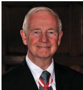
The Right Hon. David Johnston