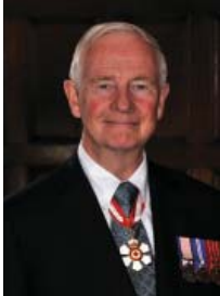
GOVERNOR GENERAL DAVID JOHNSTON Opening Plenary Aug. 14

David Johnston began his professional career as an assistant professor in the Faculty of Law at Queen's University in 1966, moving to the Law Faculty at the University of Toronto in 1968. He became dean of the Faculty of Law at the