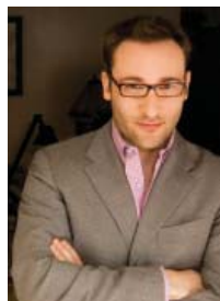
SIMON SINEK Closing Lunch Aug. 16

Arlene Dickinson is the owner and CEO of Venture Communications, a company whose guiding principle is that marketing be held accountable to business objectives. A 20-year marketing veteran, she grew Venture from a small, local firm to one of the largest independent agencies in Canada. Arlene Dickinson is the recipient of the prestigious Pinnacle Award for Entrepreneur Excellence, and has been named one of Chatelaine's TOP 100 Women Business Owners. She has also been inducted into Canada's Most Powerful Women Top 100 Hall of Fame.