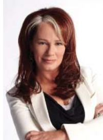
ARLENE DICKINSON Breakfast Aug. 15

Beyond her duties at the Post , Arianna Huffington is also a prominent columnist, radio host, and bestselling author of thirteen books. Her most recent work is 2010's Third World America , which details the struggle of the US middle class. A Cambridge graduate, she has appeared on many talk shows, including The Oprah Winfrey Show , and serves on the boards of several organizations that seek to solve social problems.